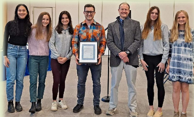
GHS Girls Indoor Track & Field Team and Select Board Chair

My office door is always open. If you have a question, concern or just want to say "hello", please feel to visit me at the Town Office, call (207) 829-3705 ext. 207, or email me at manager@northyarmouth.org