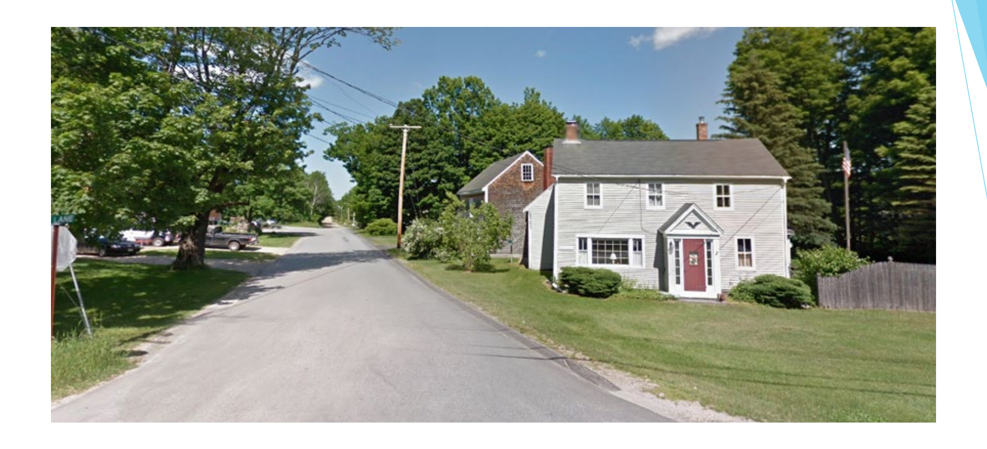
411 Walnut Hill Road