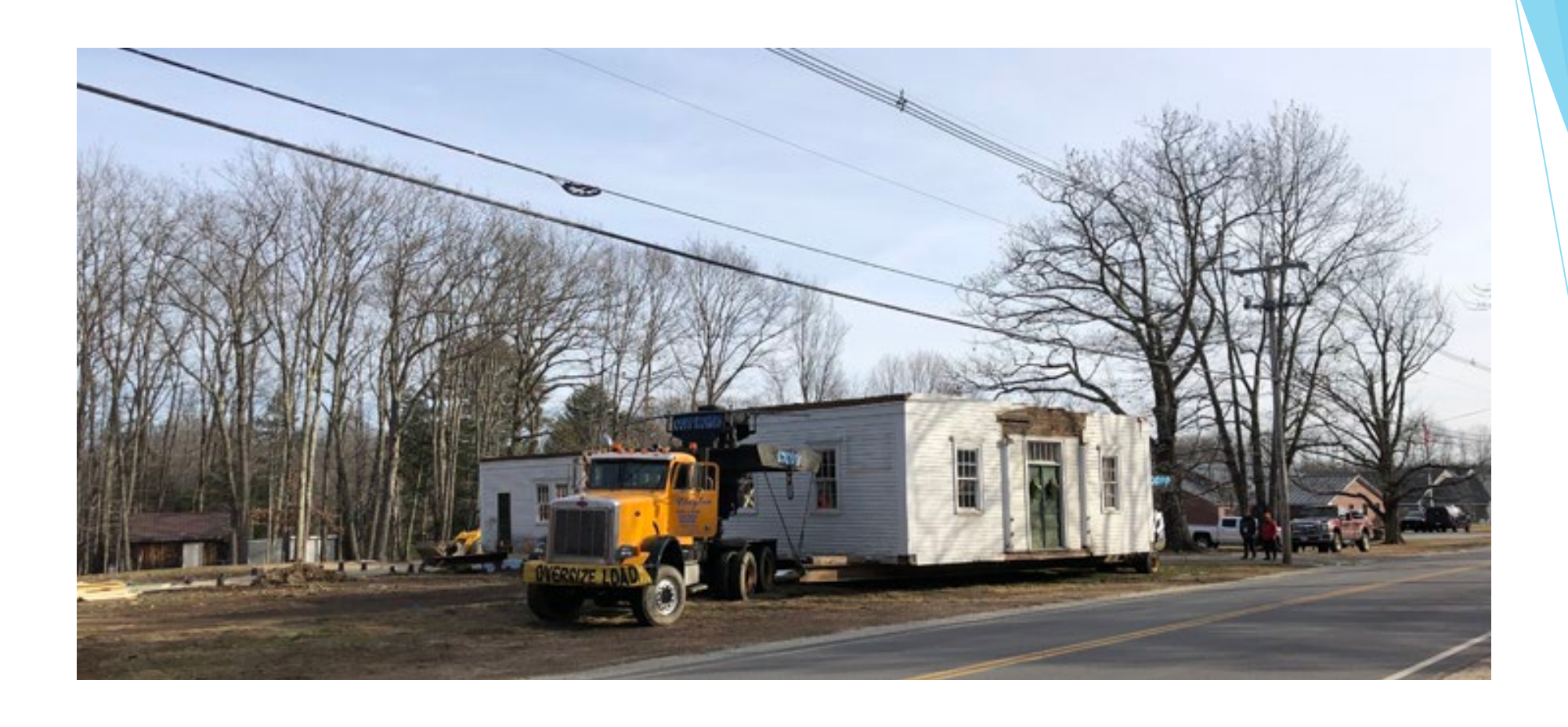
Old Town House Move