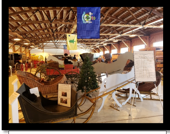
Horse-drawn vehicles, including some from the 1820's.

Celebrating Maine's Bicentennial" highlights vehicles used circa 1820 in Maine. It is rare that a museum would have one vehicle 200 years old or older; however, Skyline has many, including three four-wheeled Pleasure and Comfort Waggons (old spelling), a two-wheeled doctor's Riding Chair used in Cornish, Maine, and a Boston Chaise. Also featured are many early sleighs including the Rudyard Kipling rattan sleigh, early Albany & Portland styles, Rural Mail, Booby Hut, Hearses, Doctors, and a School Bus.