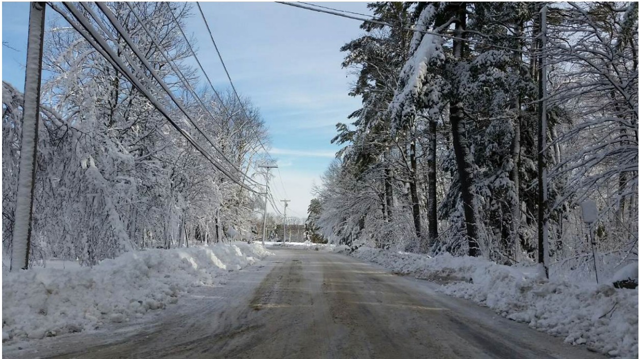
Parsonage Road day after the storm, December 31, 2016